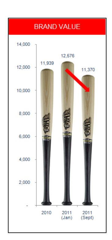
Figure 3: Brand Value in trillion dollars